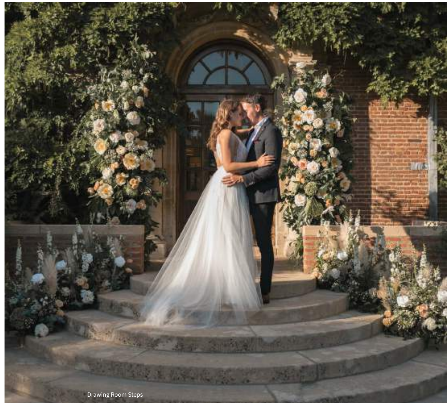
Drawing Room Steps