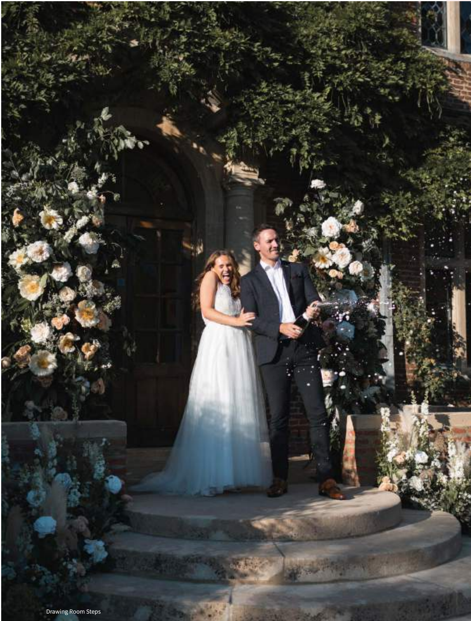
Drawing Room Steps